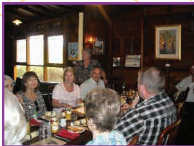
Stringy Bark Winery 2011